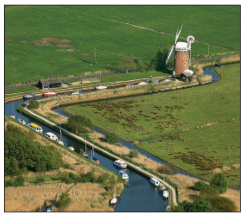
Horsey Mill (NT) used to drain the marshes but an electric pump in the shed at the side does the job now.