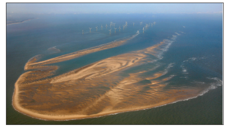
The 30 wind turbines are on Scroby Sands. Over the centuries many ships have run aground on these sandbanks.